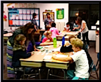
It was great to see the parents, students, and teachers from all different grades and levels just enjoying the event together last night.