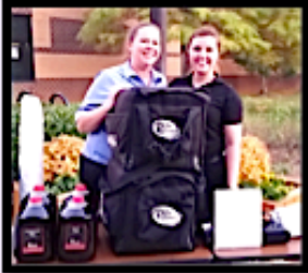
As always, our friends at Chick-Fil-A at Townridge Square were so generous toward our families needing something to eat while at the event.

With each participating classroom featuring a different country, the students had a great time traveling around the world.